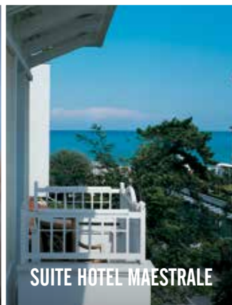
SUITE HOTEL MAESTRALE