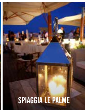
SPAGNIA LE PALME