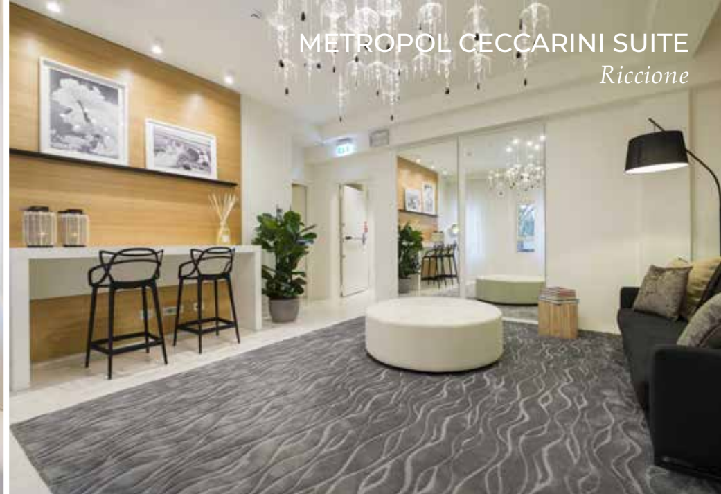
METROPOL CECCARINI SUITE Riccione