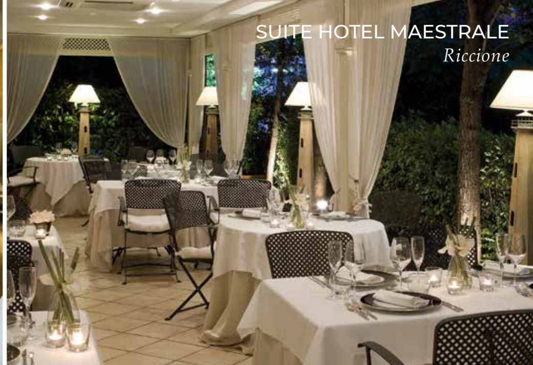
SUITE HOTEL MAESTRALE Riccione