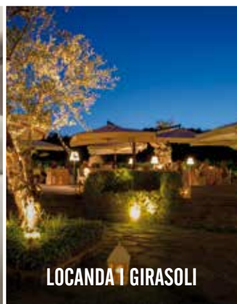
LOCANDA I GIRASOLI