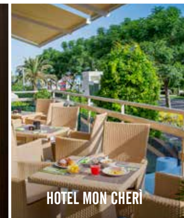
HOTEL MON CHERI