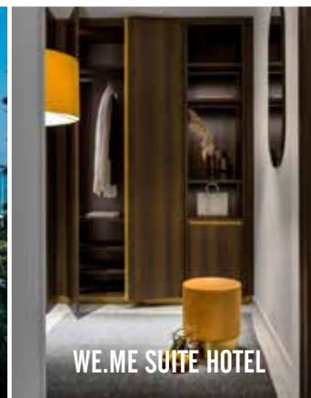
WE.ME SUITE HOTEL