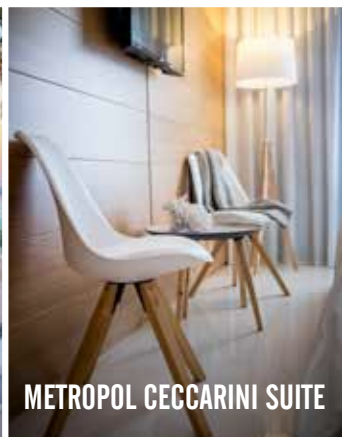
METROPOL CECCARINI SUITE