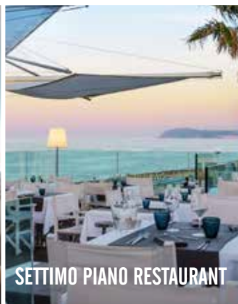
SETTIMO PIANO RESTAURANT